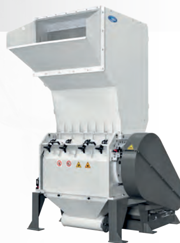
BM Series BM 7060 BM 11060 BM 16060