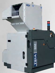
BM Series BM 3530 BM 5030 BM 7030