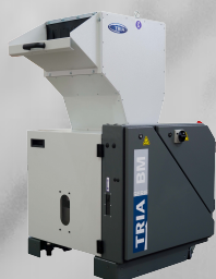
BM Series BM 4220