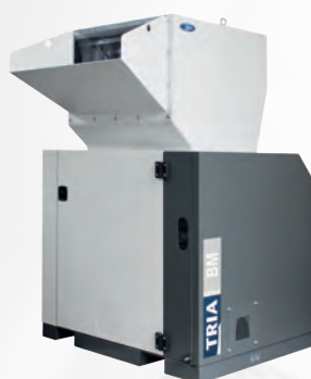
BM Series BM 6042 BM 9042 BM 12042